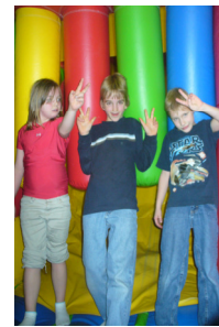
Fun at Air Mania

I think you'll enjoy this issue. Feel free to send any suggestions to graceadventures@gcconline.org .