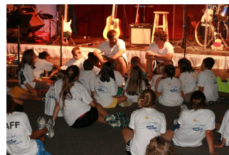
Our campers enjoying a little information of the human kind.

We've also joined Twitter. A year ago I had no idea what Twitter was, and now I'm getting tweets on my phone. It's a great way to send information and fast. Fol-